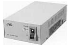
AC-C712 AC adapter kit for TK-1070U