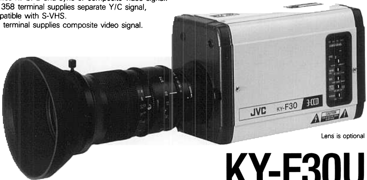
Lens is optional

The KY-F30U incorporates a selectable 1/500 second electronic shutter, making the camera suitable for the analysis of motion, etc.