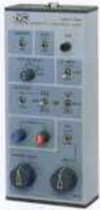
RM-LP80U Local remote control unit