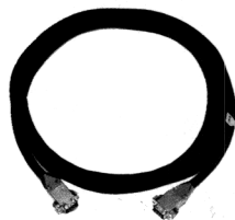
VC-464-4U Camera cable