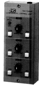
RM-713MDU Remote control unit for HZ-713 MDU