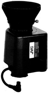
HZ-713MDU X13 Motorized zoom lens