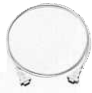
VC-452-2U Camera cable