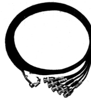
VC-451-2U Camera cable