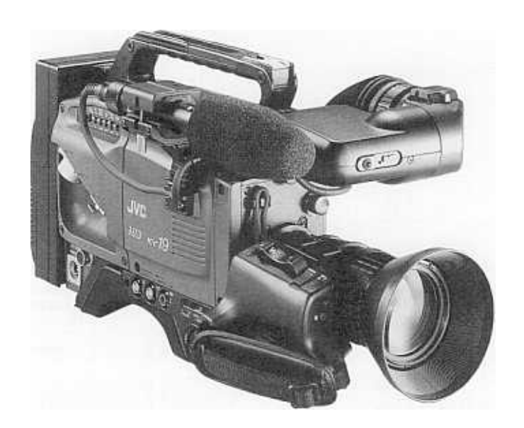
KY-19U (With optional accessories)