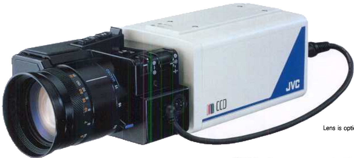
Lens is optional

With the C mount exchanging lenses is easy and a wide range of lenses can be selected. This simplifies the connection of the TK-870U to microscopes, telescopes and other optical systems. With appropriate adapters, lenses designed for use with 35 mm SLR cameras can be used with the TK-870U.